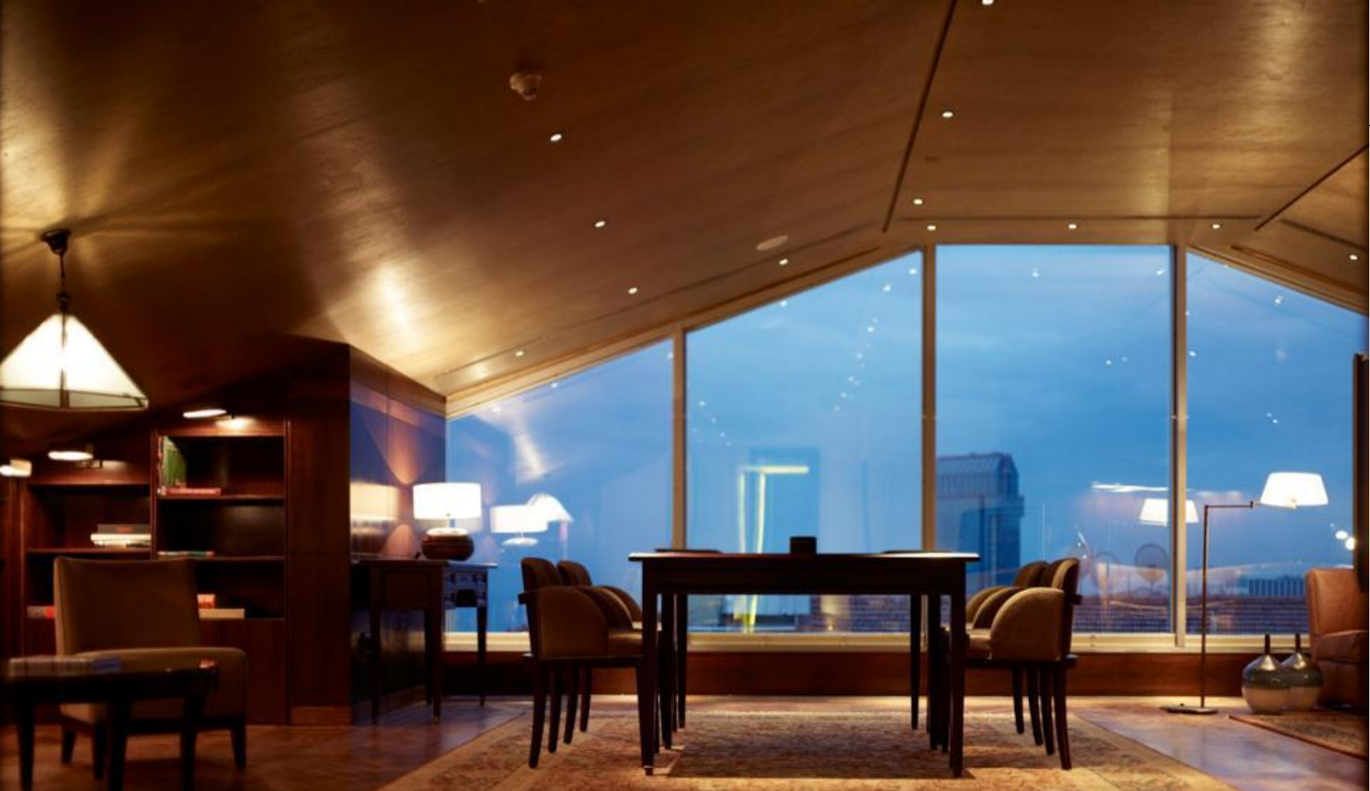
Breakout Room- Presidential Suite Second Floor with full Bosphorous View -70 Sqm